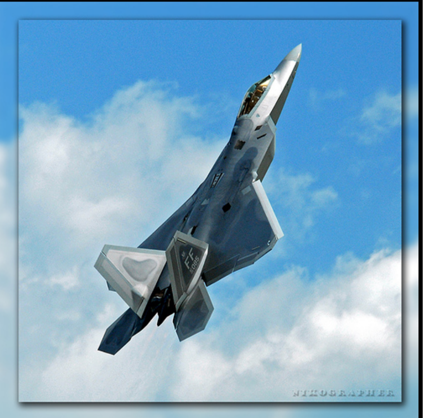
http://www.endwaronearth.com/ (22 of 37) [10/10/2007 10:59:22 AM]