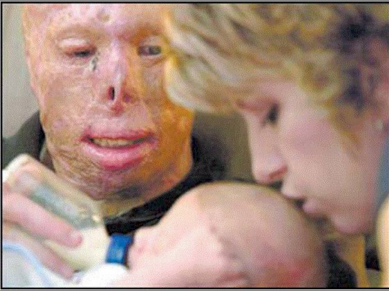
Cop burned in a

fiery wreck, not on the front page of the New York Times!