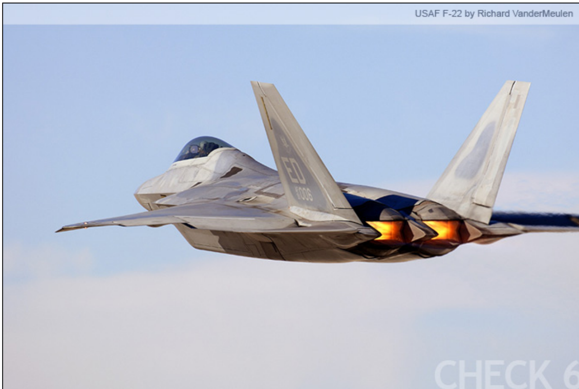
USAF F-22