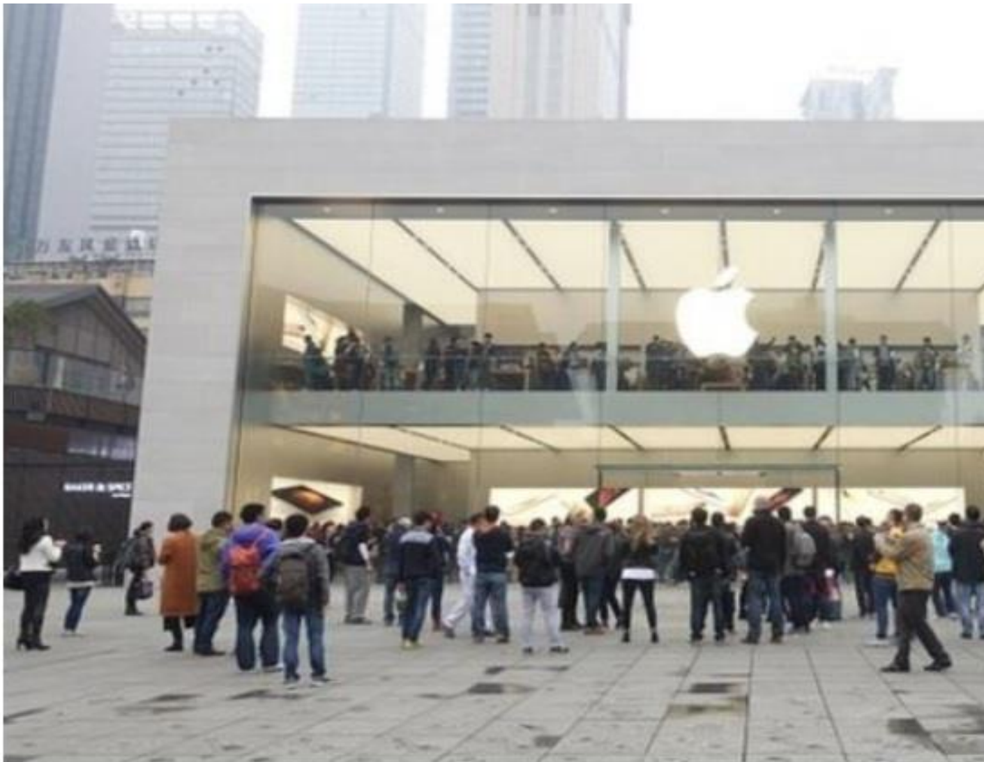
Apple's new store in Chengdu in China. All the shops are running coding

12-7-2015 Adrian Smith and Gorgon Gill Architecture, the firm behind the tower's design, said the building will also overlook the Red Sea. The Jeddah Tower will measure 3,280 feet when it's completed in 2018. It'll be the tallest tower in the world and dwarf the current record holder, Dubai's Burj Khalifa. The Jeddah Tower will measure 3,280 feet when it's completed in 2018. It'll be the tallest tower in the world and