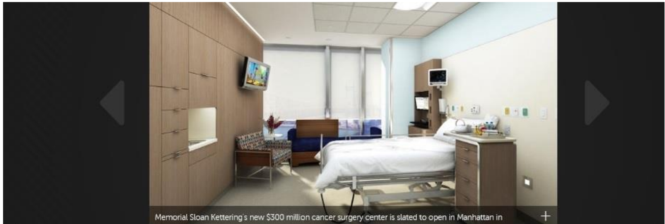
Memorial Sloan Kettering's new $300 million cancer surgery center is slated to open in Manhattan in