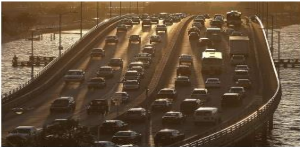
Traffic ahead of Thanksgiving in Miami Beach, Fla., when drivers paid the lowest gas prices around the holiday since 2008.