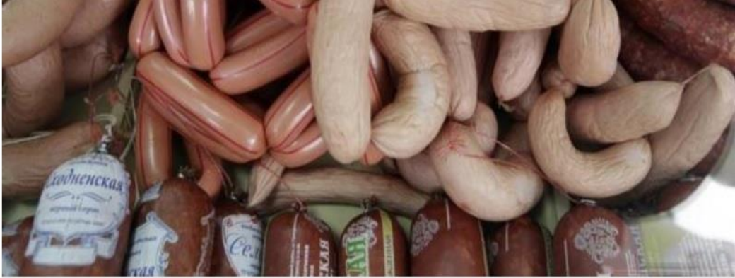
A vendor sells sausages prepared at a local sausage shop of the "Russia" collective farm in the settlement of Grigoropolisskaya, northwest of the southern city of Stavropol, February 17, 2015.

Eating processed meat can lead to bowel cancer in humans while red meat is a likely cause of the disease, World Health Organisation (WHO) experts said on Monday in findings that could sharpen debate over the merits of a meat-based diet.