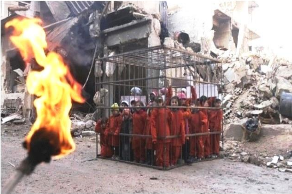
Children were herded into a cage in Douma, near Damascus, evoking an Islamic State video, to draw attention to violence in Syria.