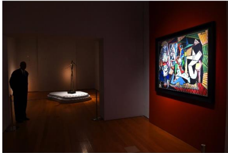
Picasso's "Les Femmes d'Alger (Version O)" at right and Giacometti's "Man Pointing" at Christie's in New York. The Picasso sold for a record price this week.