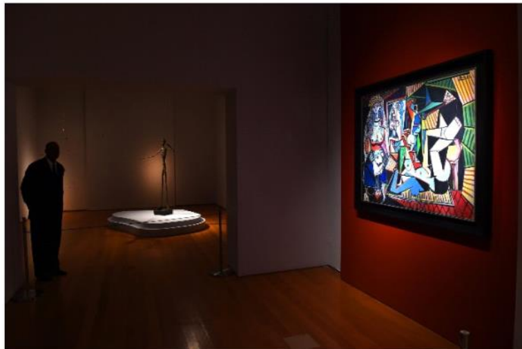
Picasso's "Les Femmes d'Alger (Version O)" at right and Giacometti's "Man Pointing" at Christie's in New York. The Picasso sold for a record price this week.