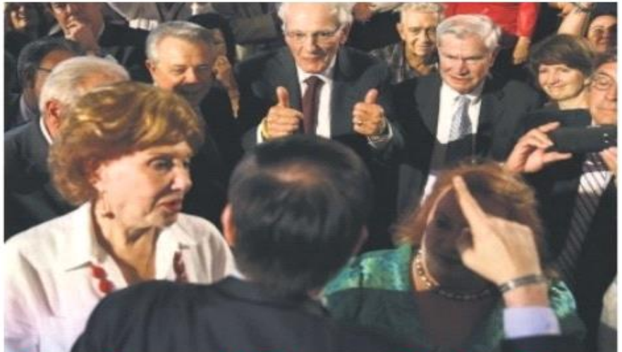
Front Page on NY Times on Mothers Day