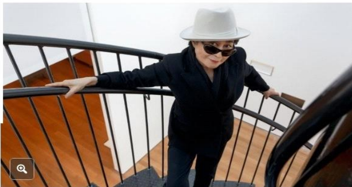
Yoko Ono at the Museum of Modern Art during the installation of "Yoko Ono: One Woman Show,"

Yes Greg + Wives in Key West will get this Gravity Control Invention and of course the "Gravity Engine" for the flying cars.