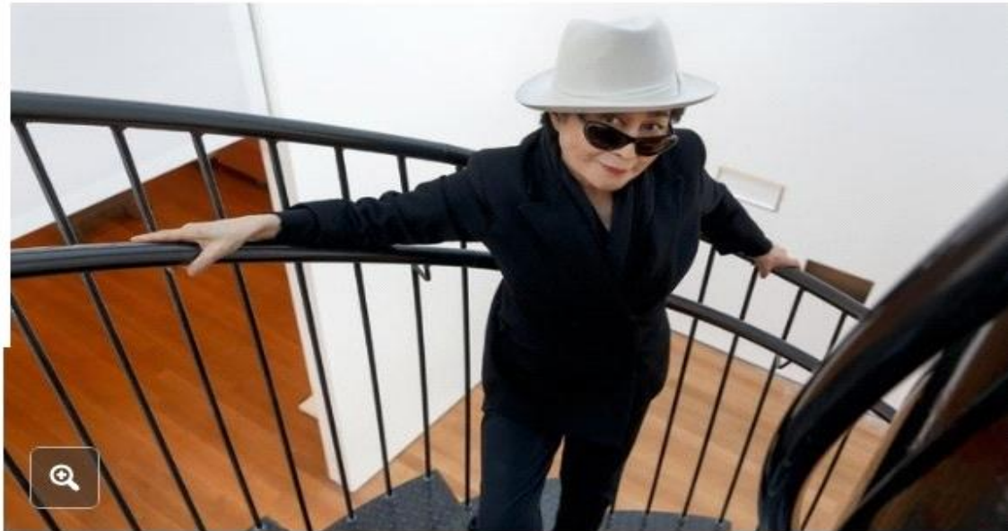
Yoko Ono at the Museum of Modern Art during the installation of "Yoko Ono: One Woman Show,"

Yes Greg + Wives in Key West will get this Gravity Control Invention and of course the "Gravity Engine" for the flying cars.